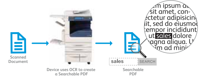
*Optional Searchable PDF Kit is required

Easy archiving, organising and searching. With scan to searchable PDF*, you can create a fully text-searchable file and integrate it into your workflow process in one easy step.